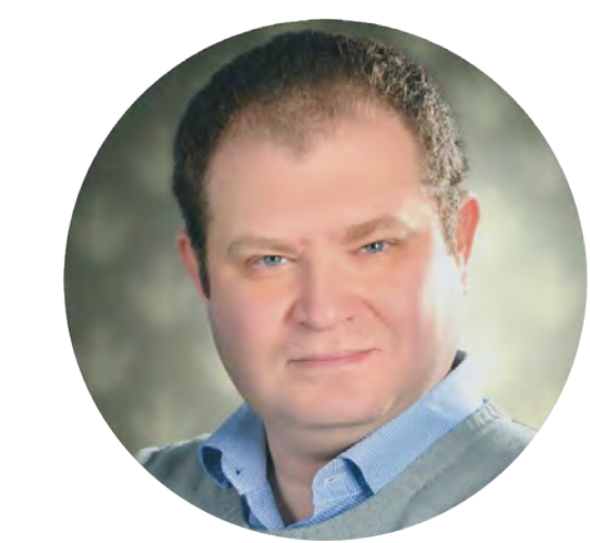
Technical Officer, Department of Mental Health and Substance use WHO Geneva; Co-Chair, IASC MHPSS Reference Group for Mental Health and Psychosocial Support in Emergencies.