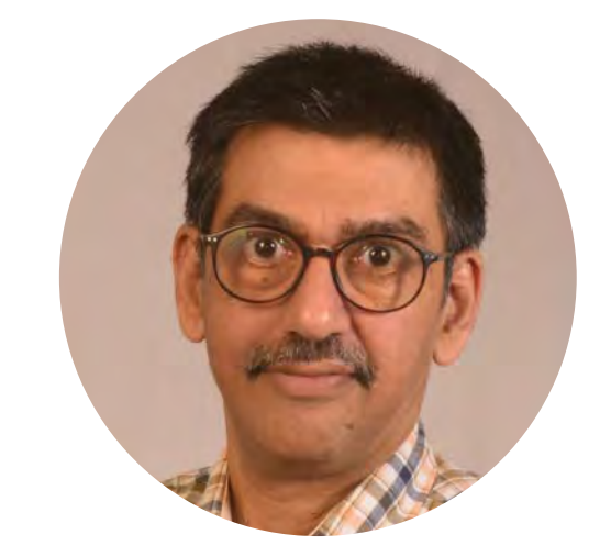
Director, Centre for Mental Health Law & Policy, ILS