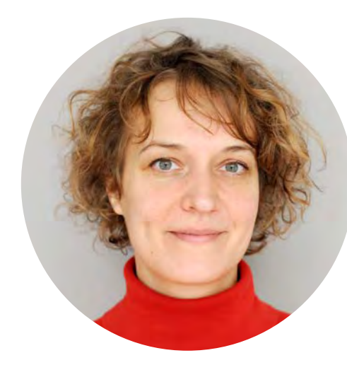
Policy advisor at the German Institute for Human Rights