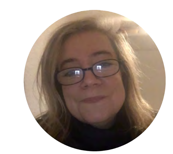
Technical Officer, Policy, Law and Human Rights Unit, Department of Mental Health and Substance Use, World Health Organization