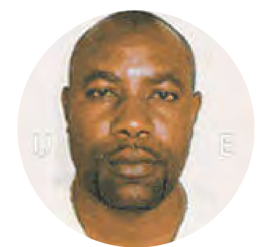
Founder and President of the Mental Health Users Network of Zambia (MHUNZA)